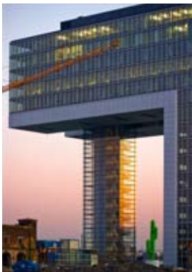
Kranhaus designed by Hadi Teherani, one of the leading European architects.

The Rheinauhafen is thrilling for more than just its proximity to the city centre of Cologne. The interplay of historic and modern architecture, in particular, as well as the location of the complex directly on the Rhine make it an extremely attractive new urban district – and one that still retains its original character: natural stone paving, old sections of rails, and restored harbour cranes are combined with large-format concrete slabs, glass, steel, and sophisticated lighting design. Thus the Rheinauhafen is taking on a new appearance, but retains typical characteristics of its original use as a harbour.